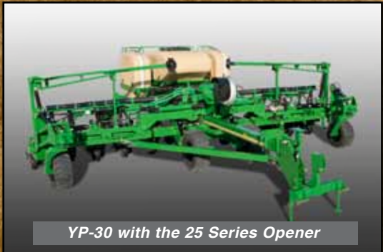
YP-30 with the 25 Series Opener